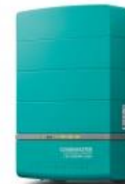
12VDC 3000W 160A Charger