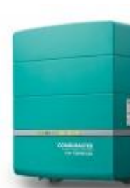
12VDC 1500W 60A Charger