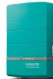
12VDC 2000W 100A Charger